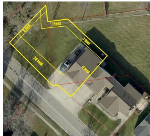
Proposed setbacks for zero-lot line development utilizing garage (consistent with P&Z approval in 2021).