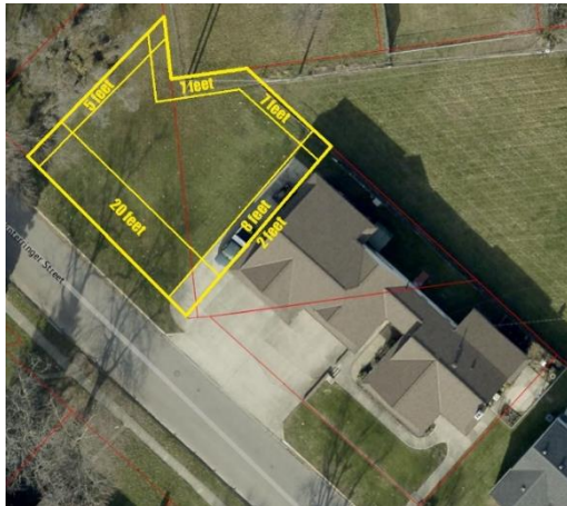
Setbacks based upon variances as approved by the Board of Zoning Appeals (2021)