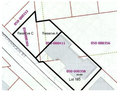
Lot layout based upon variances as approved by the Board of Zoning Appeals (2021)