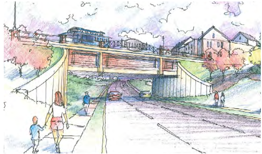
Above: The 2011 Comprehensive Plan illustration showing changes to the bridge over Cemetery Road incorporating design elements of railroad history.