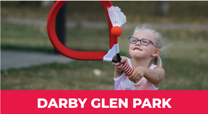
DARBY GLEN PARK

By providing a clean, safe and well-maintained environment with a friendly, professional, and wholesome atmosphere, the Recreation and Parks Department takes pride in providing endless economic, social, and health benefits to the Hilliard community.