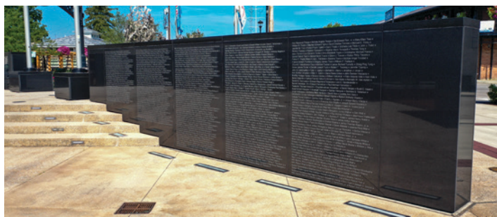
FIRST RESPONDERS PARK