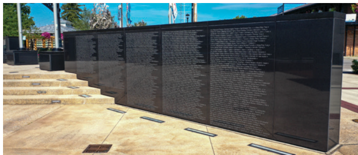
FIRST RESPONDERS PARK