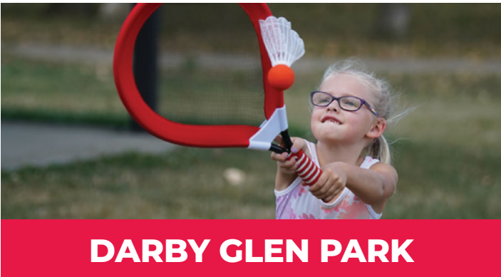
DARBY GLEN PARK

By providing a clean, safe and well-maintained environment with a friendly, professional, and wholesome atmosphere, the Recreation and Parks Department takes pride in providing endless economic, social, and health benefits to the Hilliard community.