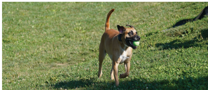
HERITAGE TRAIL DOG PARK