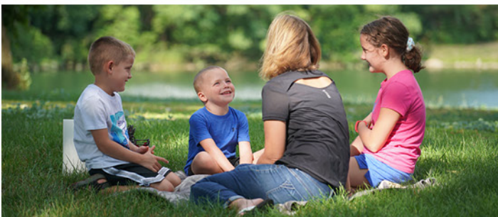
BRITTON FARMS PARK

By providing a clean, safe and well-maintained environment with a friendly, professional, and wholesome atmosphere, the Recreation and Parks Department takes pride in providing endless economic, social, and health benefits to the Hilliard community.