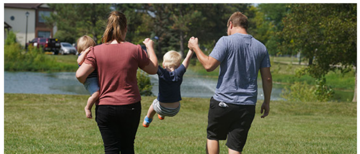
HAYDEN RUN VILLAGE PARK