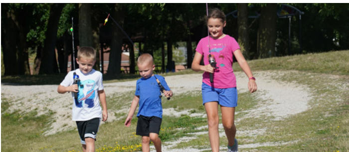
BRITTON FARMS PARK

By providing a clean, safe and well-maintained environment with a friendly, professional, and wholesome atmosphere, the Recreation and Parks Department takes pride in providing endless economic, social, and health benefits to the Hilliard community.