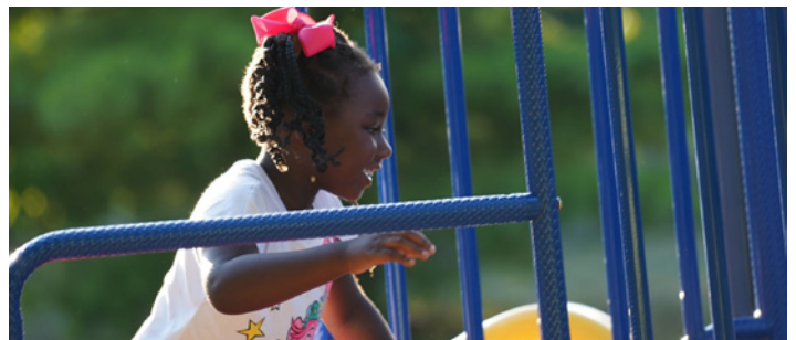
HILLIARD EAST PARK